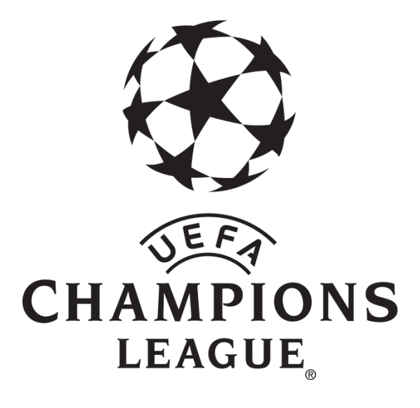
Figure 2 The UEFA Champions League Starball logo

Colours and logo are extensively divulged to spectators and players. Regardless country, city or stadium, it is possible to see these symbols reproduced on players and stewards' bids, tickets, panels' backdrops used during interviews to players and coaches, different kinds of advertisements inside (led banners) and outside (blanket banners) the stadiums or,on the wide Starball banner waved by local kids at the centre of the pitch at start of every match during the opening ceremony accompanied by the UCL anthem. As underlined in TEAM's UCL report: "irrespective of whether you are a spectator in Moscow or Milan, you will always see the same stadium dressing materials, the same opening ceremony featuring the 'starball' centre circle ceremony and hear the same UEFA Champions League Anthem' (TEAM, 1999: 56 as found in Chadwick & Holt, 2006).